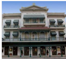
CSAP at the Menger Hotel

CEUs available. For more check out the website at csap.org !