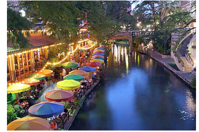
San Antonio's River Walk